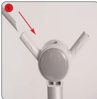
Fit the two long support arms to the telescopic pole hub. Note the orientation of the support arm to the hub.