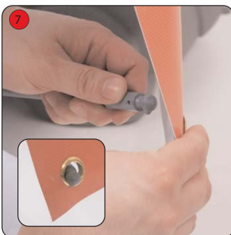
Attach the bottom graphic eyelets to the short support arms.