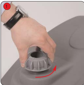
Unscrew the base cap.