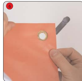
Attach the top graphic eyelets to the long support arms.