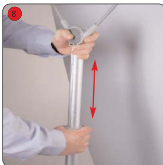
Raise the telescopic pole to the desired height to tension the graphic.