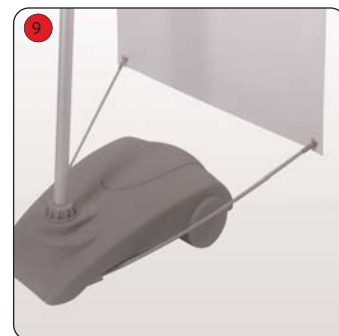
Graphic attached to the base.