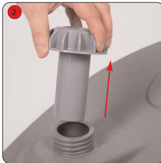
Remove the cap, fill the base with water or sand and re-fasten the cap.