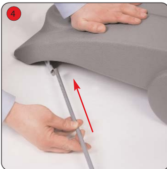
Fit the two short support arms into either side of the base.