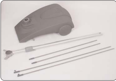
Base, telescopic pole, 2 short support arms and 2 long support arms